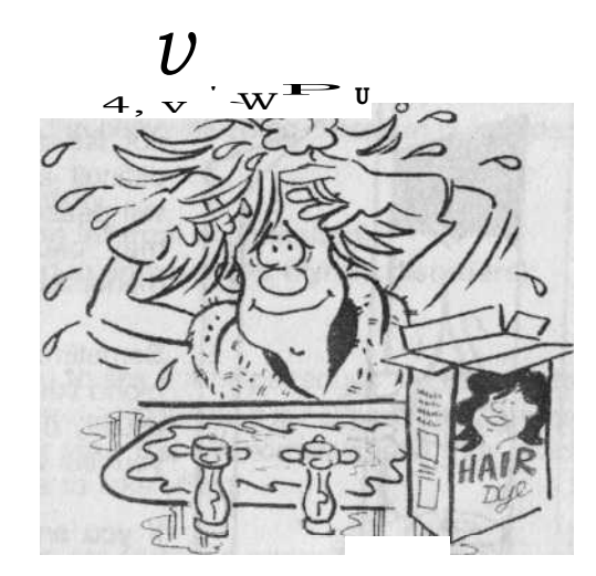
"According to my previous doctor I have this problem because I'm a red-head..."

Sometimes heavy bleeding is caused by large fibroids. These are non-cancerous growths, consisting of bundles of